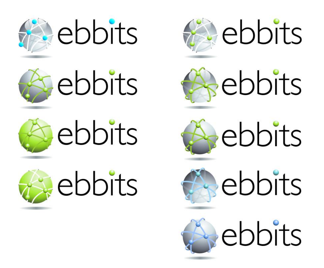
Table 7 Second round logo designs

Based on the initial vote, the designer produced another set of logos with the globe as the main design element. The globe signals that the Internet of Things spans the globe and reaches to the farthest corners to connect to a product in any life-cycle phase.