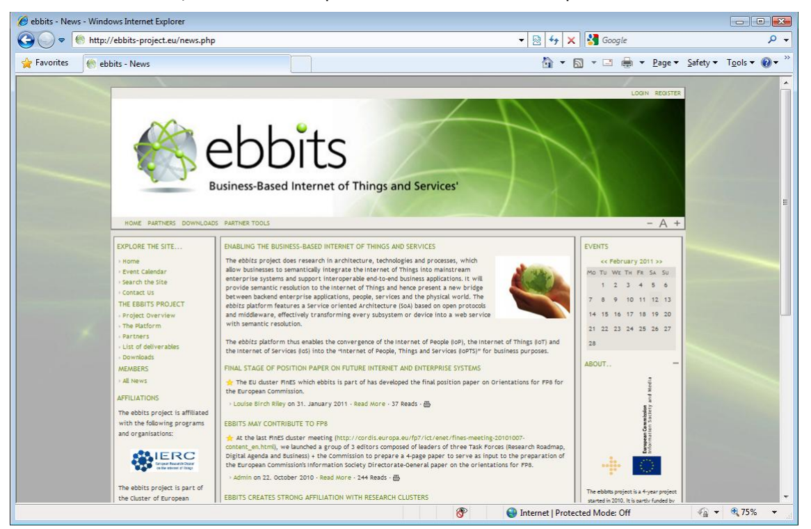
Figure 3 Project website front page

The website will be kept updated with news, public deliverables, articles and material from participation at events (e.g. slides of presentations, keynote speeches and conference proceedings). The site will also display (subject to copyright restrictions) papers and presentations given by consortium members, whether at European conferences or workshops.